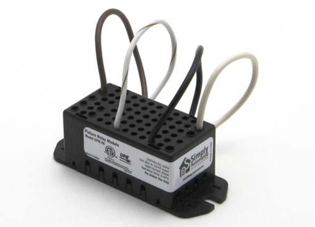
Model UFD - Wire-in Fixture Module - Dimming Model UFR - Wire-in Fixture Module - Relay